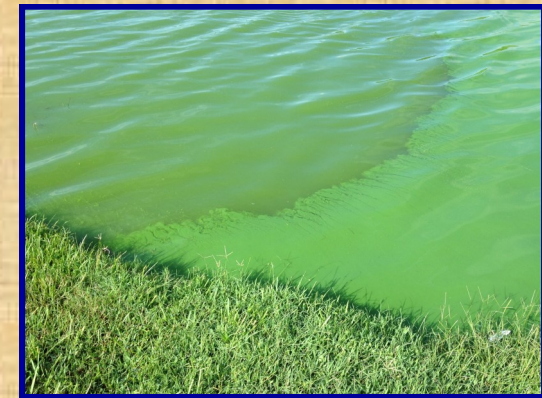
Example of harmful algal bloom.