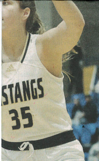
ot in front of Southwest e.

on the bench louder, can I be helping people if I see something on the floor they can't see? It's buying into the team mentality and putting away our personal pride for the benefit of the team and for something greater than ourselves."